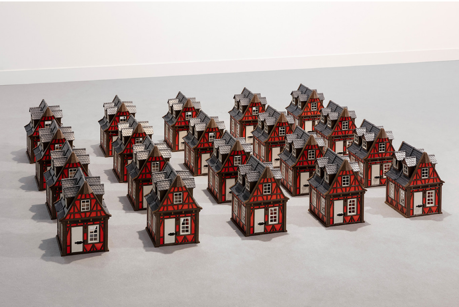
Untitled , 2019 20 found Playmobil houses Dimensions variable