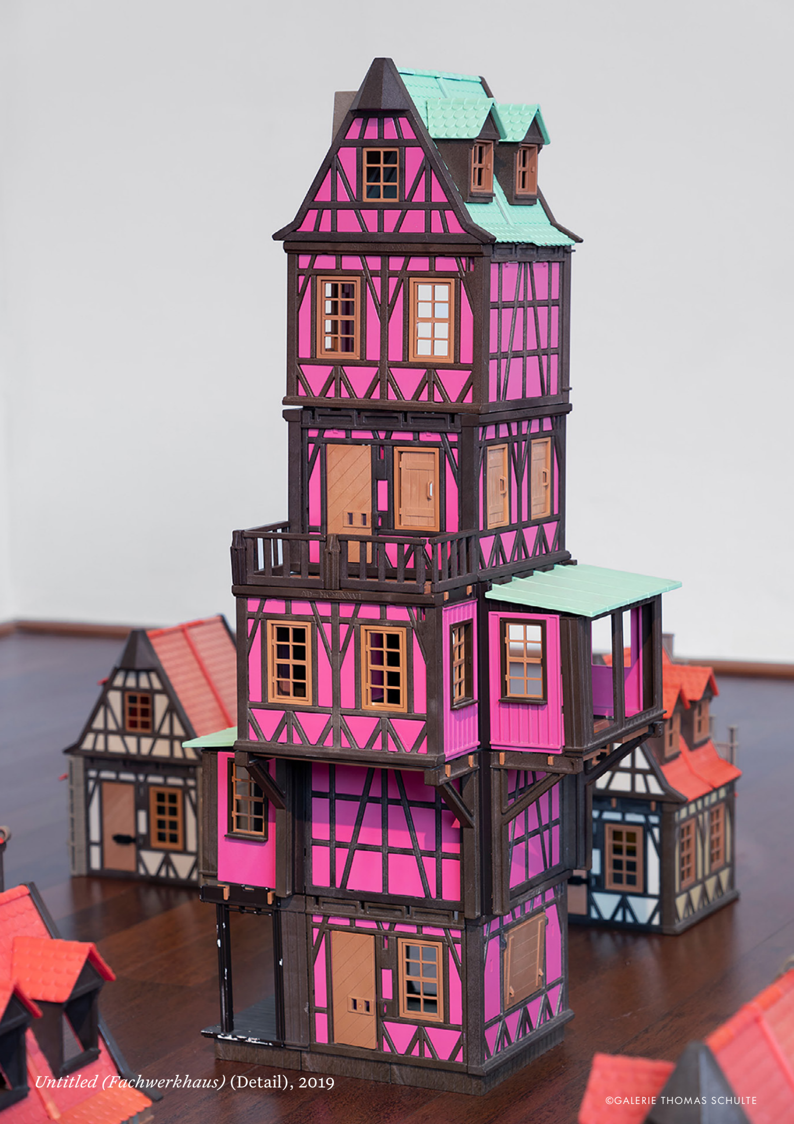
Untitled (Fachwerkhaus) (Detail), 2019