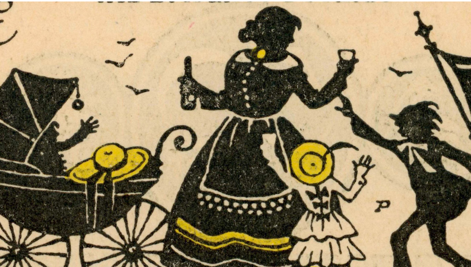
Fragments of a Crisis , 2023 (Film Still) Digital video loop / projection Approx. 11 min. Edition of 5 plus 2 artist's proofs